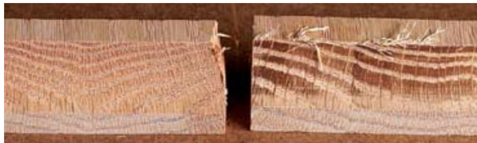
The first cuts with each bit varied widely, from the fuzz-free cut of a typical premium cove bit (left) to the burning and fuzzy edges caused by a low-cost cove (right).