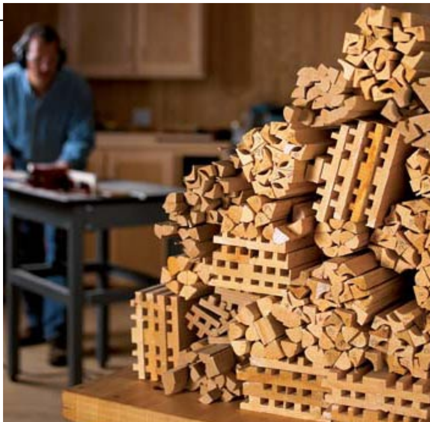
These bundles of 4'-long workpieces represent a mere fraction of the oak and MDF we machined to learn what separates premium- and low-cost router bits.

Or is low-dough the way to go? We milled more than a mile and a half of material to find the differences between the highest- and lowest-priced router bits.